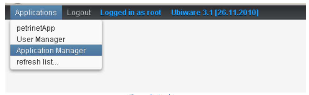
Figure 2: Desktop

When you log in for the first time, you will see that there is just one application available. It is called "Application manager". Application manager shows you what kinds of applications are available on the platform and allows you to install (select) any of them. The next section explains how it is done.