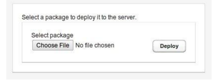
Figure 4). You just click on the Browse button and provide the UBI file you want to deploy and press "Deploy" button. The deployment may take several minutes. After the deployment a "success" or "failure" message will be shown to you.