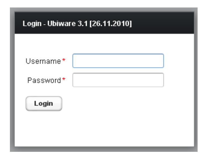
Figure 1: Login screen

Wait a few seconds until the platform starts up. Then open your web browser and go to the address http://localhost:8080/. You should see the main login window as shown in Figure 1.