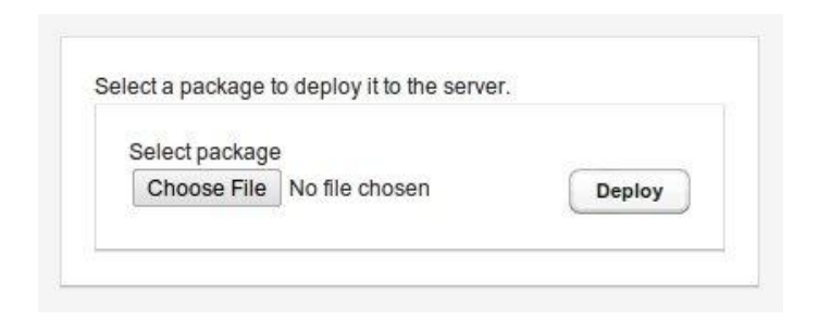
Figure 4: Package deployer application